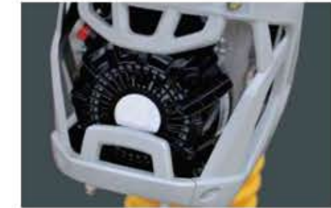
Engine protection frame with full wrap around.