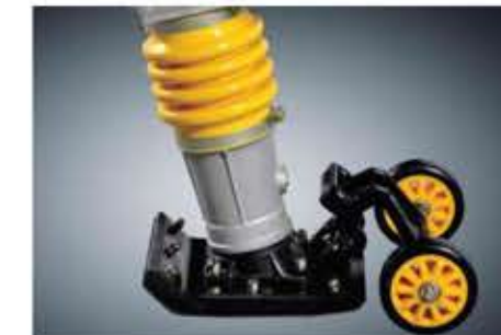
Optional transport wheel