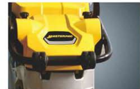
Convenient roller for easy loading