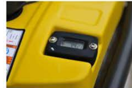
Tachometer for RPM and Hours standard.