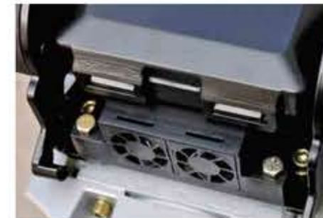
Strong cyclone air filter