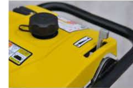
Throttle operation with integrated engine shutoff.